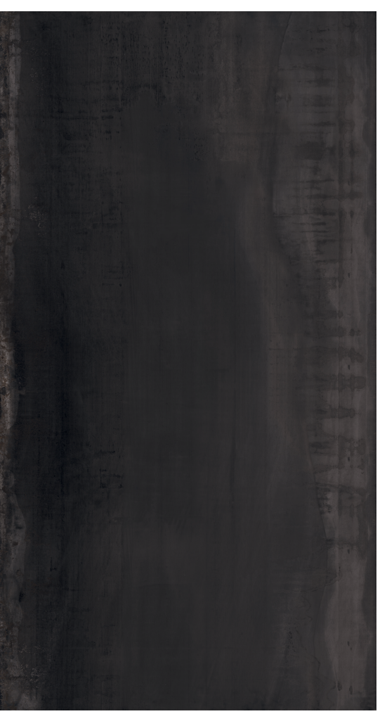
CORTEN IRON L