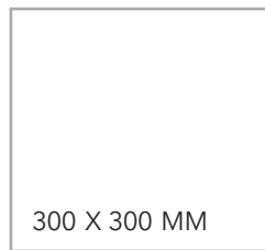
300 X 300 MM