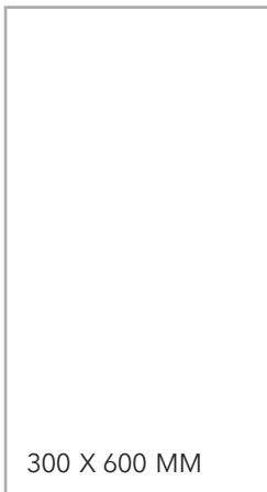
300 X 600 MM